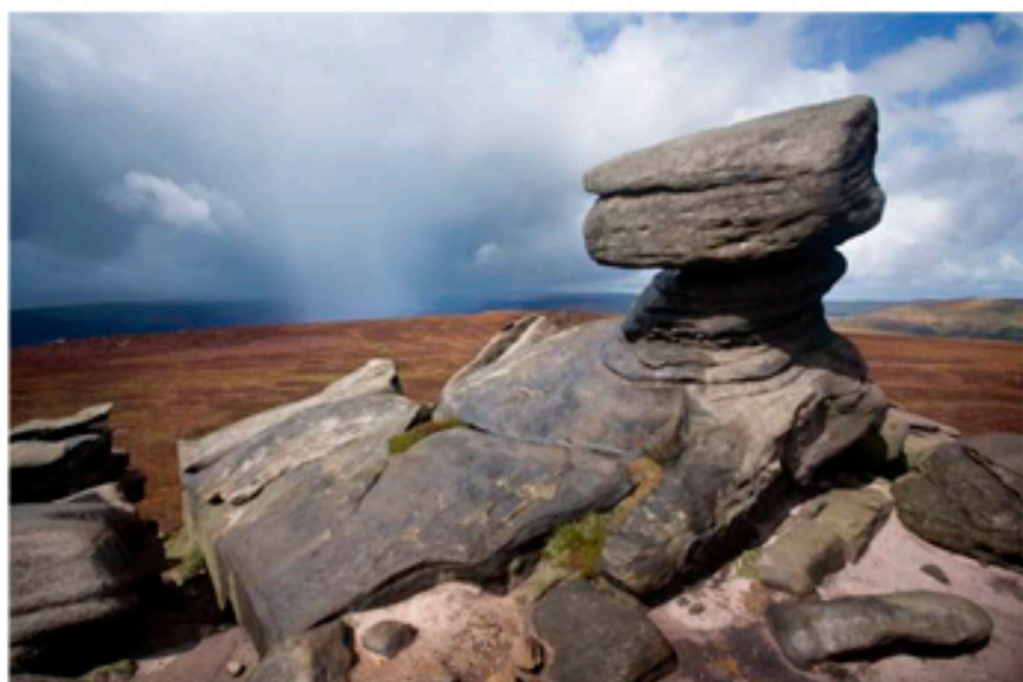
Derwent Edge, Back Tor, incoming storm

Sunset (photo: Derwent Valley, Hagg Side and Kinder Scout) – as the sun dips below mid-level cloud golden beams spill across a small part of the landscape while much of the Derwent Valley remains in shadow. These conditions create a broad tonal range that is difficult to capture in camera. However, it is worth the effort as the heightened contrast creates a dramatic image. Kinder Scout's northern slopes appear back-lit against luminous sky and the silhouetted escarpment provides an instantly recognisable feature within the landscape.