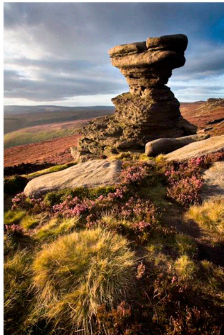
Derwent Edge, Salt Cellar, heather and grasses

Early evening (photo: Derwent Edge, Salt Cellar, heather and grasses) - by now the light is softer because the sun is much closer to the horizon and has to travel through more atmosphere before reaching the ground. It is also more colourful, taking on a golden hue that complements the sandstone's mineral pigments. Because of the sun's position shadows are significantly longer, which is ideal as it creates a more textured and three-dimensional impression of the Salt Cellar. This is helped by using side-lighting and when planning to visit a location I will work out at what time of day the subject is likely to be side-lit.